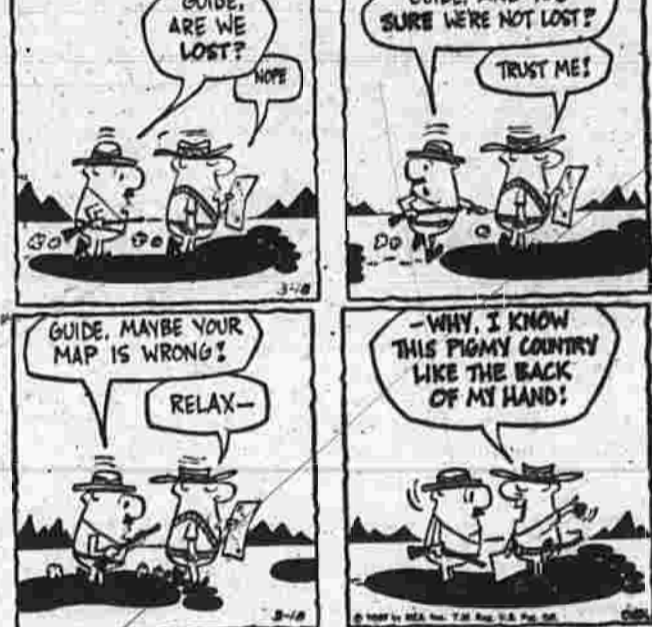
SHORT RIBS BY FRANK O'NEAL